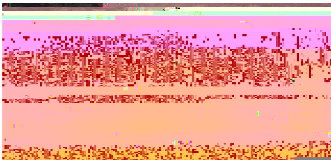
Second World War memorial Cloisters, New College, Oxford